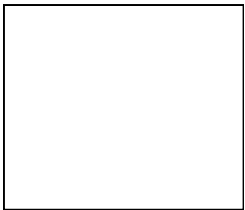
2 x 2 PHOTOGRAPH